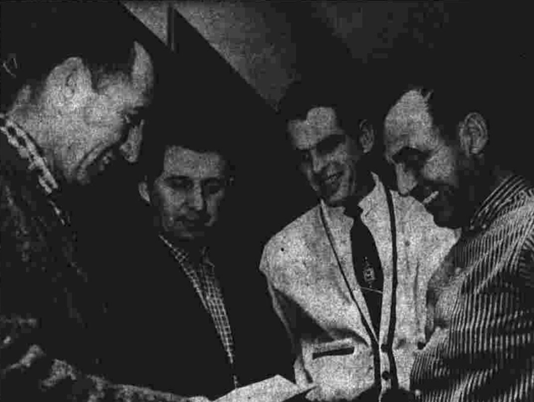
Little League Baseball Umpires Review Rule Book